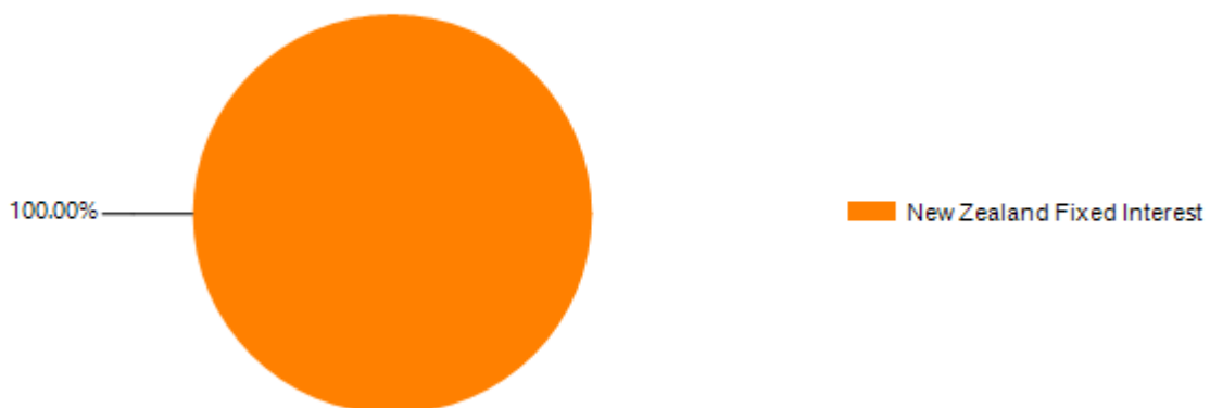
Target Investment Mix

The fund's foreign currency fixed interest securities are largely hedged back to the New Zealand dollar. Investment in international fixed interest is restricted to the Australian fixed income market either through Australian denominated debt securities or derivative instruments.